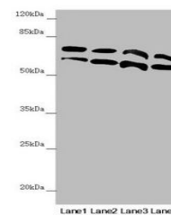
Western blot analysis of K562 whole cell...