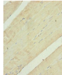
Immunohistochemistry of paraffin-embedde...