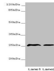
Western blot aanalysis of Mouse gonadal ...