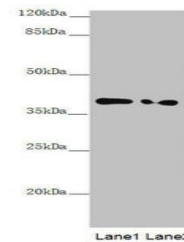
Western blot analysis of PC-3 whole cell...