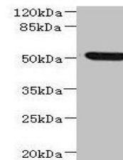
Western blot aanalysis of HepG2 whole ce...