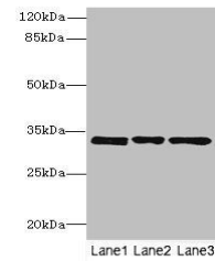
Western blot analysis of MCF7(lane 1), H...