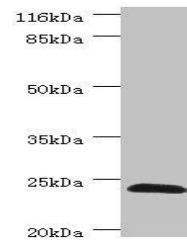
Western blot analysis of Mouse liver tis...