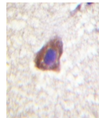
Immunohistochemical analysis of CD130 st...