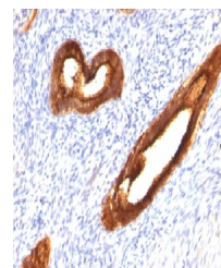
Immunohistochemical staining of human En...