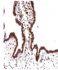
Immunohistochemical staining of human Ov...