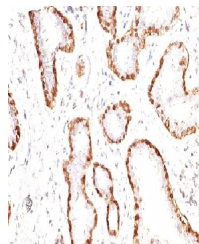
Immunohistochemical staining of human Br...