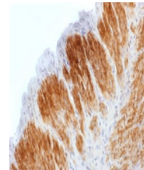
IHC testing of FFPE rat uterus stained W...

Store the recombinant Calponin antibody at 2-8°C (with azide) or aliquot and store at -20°C or colder (without azide).