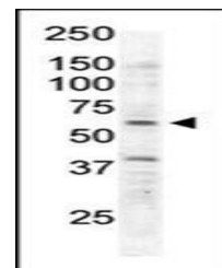
Western blot analysis of Jurkat cell lys...