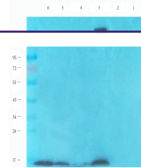
Western blot analysis of rat lymph node ...