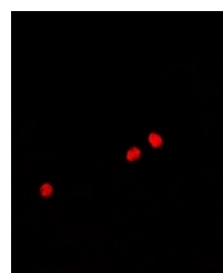
Immunofluorescent analysis of GADD45 alp...