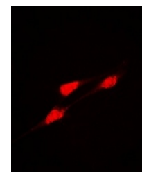
Immunofluorescent analysis of DLGAP5 sta...