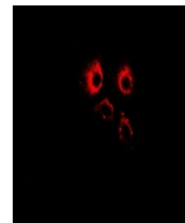
Immunofluorescent analysis of ADAM9 staining...