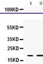
WB analysis of Peptide YY using anti-Pep...