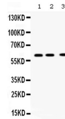
WB analysis of CCT8 using anti-CCT8 anti...