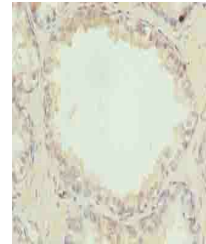
Immunohistochemical staining of human prostate tissue showing ACSBG1 expression.