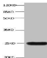
WB analysis of NGAL transfected 293 cell...