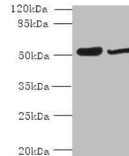
Western blot analysis of Mouse heart ti...