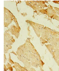
Immunohistochemistry of paraffin-embedde...