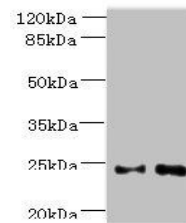
Western blot aanalysis of HeLa whole cel...