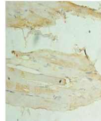
Immunohistochemical staining of human Sk...