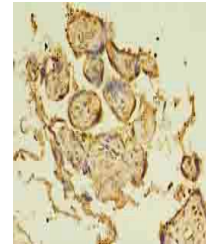
Immunohistochemical staining of human pl...