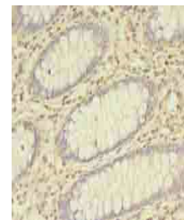
Immunohistochemical staining of human CO...