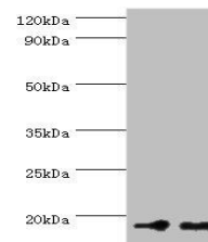
Western blot aanalysis of Hela whole cel...