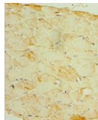
Immunohistochemistry of paraffin-embedde...