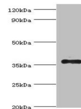
Western blot analysis of A549 whole cell lysate.