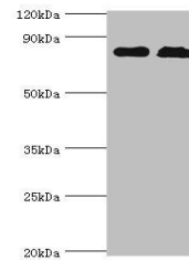
Western blot analysis of PC-3 & HeLa who...