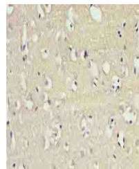
Immunohistochemical staining of human brain tissue.