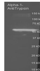
Western Blot of Goat Anti-ALPHA 1 ANTI T...