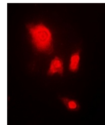
Immunofluorescent analysis of UCH-L5 sta...