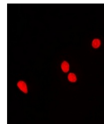
Immunofluorescent analysis of RNGTT stai...