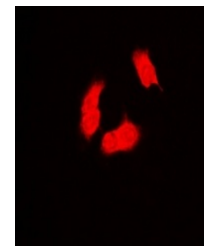
Immunofluorescent analysis of PSMB9 staining...