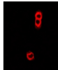
Immunofluorescent analysis of TAP2 stain...