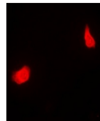
Immunofluorescent analysis of PSMC5 staining...