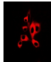
Immunofluorescent analysis of AdipoR1 st...