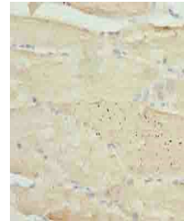
Immunohistochemical staining of human skin...