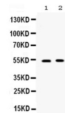
WB analysis of CD134 using anti-CD134 an...