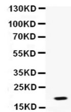
WB analysis of NAP2 using anti-NAP2 anti...