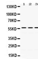
WB analysis of ERp57 using anti-ERp57 an...