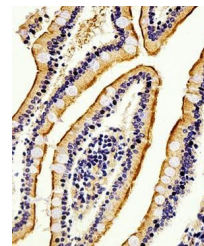
Immunohistochemical staining of human sm...