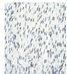
Immunohistochemical staining of human He...