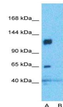
Western blot analysis of Fetal Muscle ti...