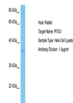
Host: Rabbit, Target Name: PITX3, Sample...