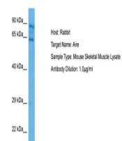
Host: Rabbit, Target Name: AIRE, Sample ...