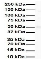
Western blot analysis of human Liver tis...