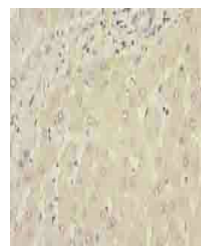
Immunohistochemical staining of human li...