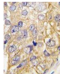
Immunohistochemical staining of human pr...